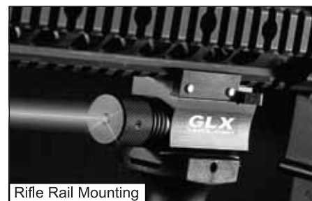
Rifle Rail Mounting