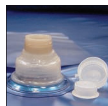
c. Remove Pull-Cap and Seal