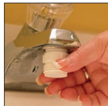
a. Connect Faucet Adapter