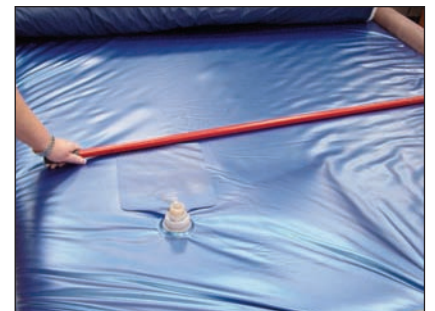
Removing Air Bubbles Using a Broom Handle