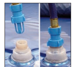
d. Connect hose to Perfect Union, then connect Perfect Union to mattress valve